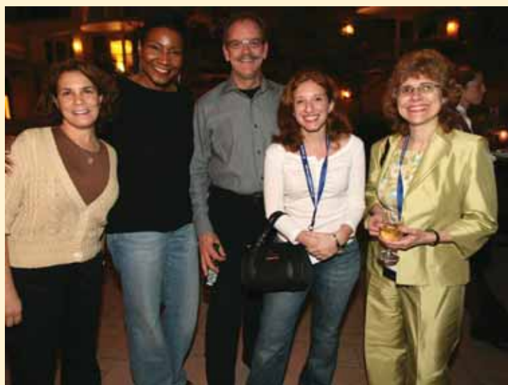
Winter Symposium participants enjoy an evening of conversation during the terrace-side cocktail reception