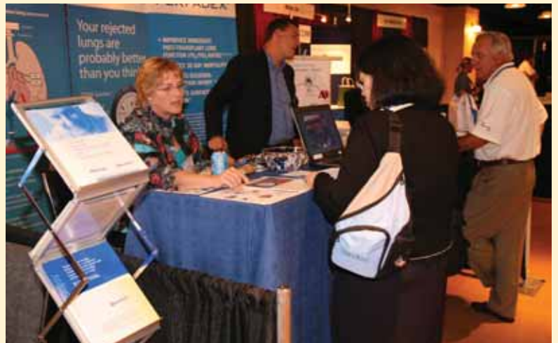
The ASTS is grateful to the many exhibitors for helping participants understand the role industry and other transplantation programs play in helping to create the latest technology in transplant medicine