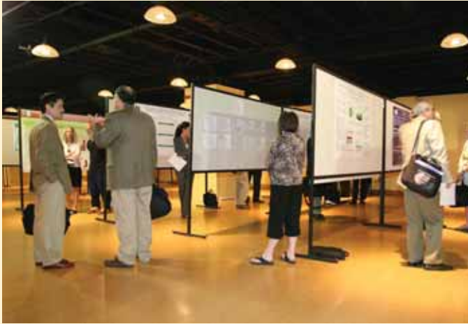
Participants were drawn to more than 70 diverse posters on display

Attendees enjoyed the scientific and social aspects of the events