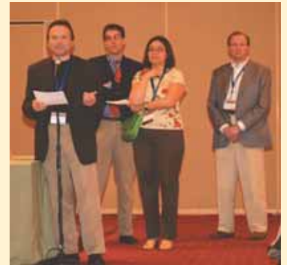
Participants in line at microphone for Q&A