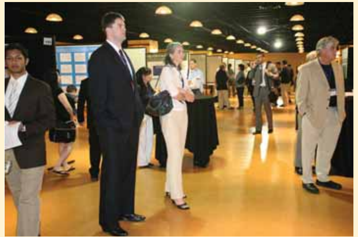
Immediately after the Keynote Speaker Session, symposium participants crowded the Collier Exhibit Hall for a chance to view posters and to listen to impressive mini-oral presentations