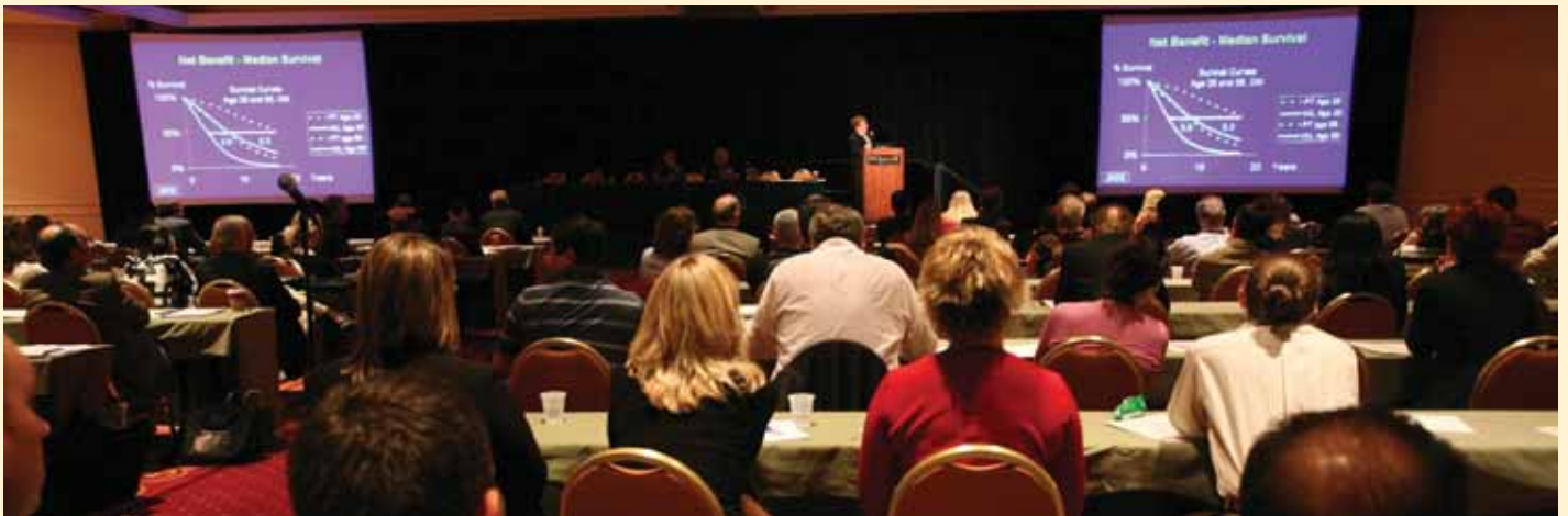
Stellar turnout during the symposium presentations