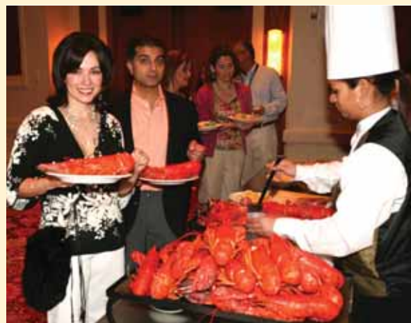
There is plenty to go around! Friday evening dinner