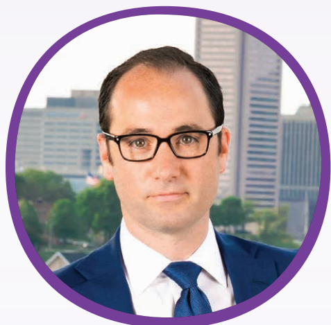
Dr Joseph Scalea

Keeping InSight is a healthcare podcast from Sanofi featuring conversations between prominent medical professionals and Sanofi. The following 2 episodes include conversations about important topics in transplantation: